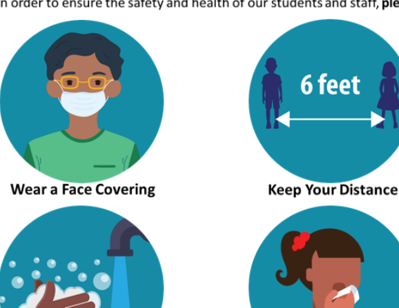
Wash Your Hands Often & Well, or Use Hand Sanitizer

In order to ensure the safety and health of our students and staff, please: